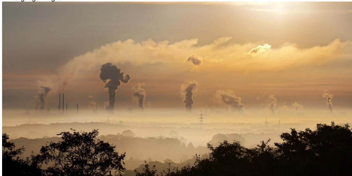
Air pollution

Most people say they would never go back to the days when restaurants, offices, and even airplanes were filled with cigarette smoke. Someday, we may be able to talk about air pollution in the same way – but governments will have to take a similar road to get there.