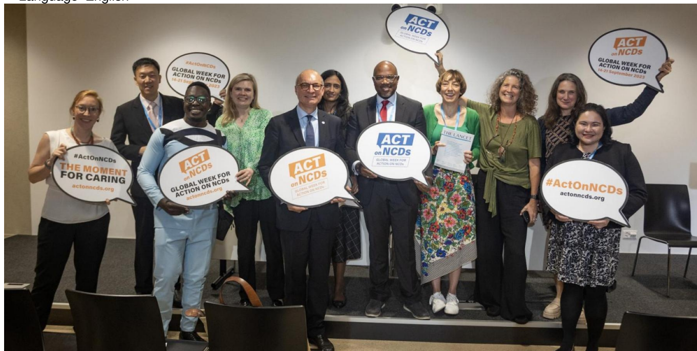
NCDA at WHA 76

The NCD movement's efforts to accelerate action on NCDs have paid off this year. From raising the profile of NCDs and people living with NCDs on national and international health agendas to concrete policy wins, here are the 10 highlights of 2023.