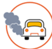
AIR POLLUTION 32

Learn more about the risk factors for NCDs. [10]