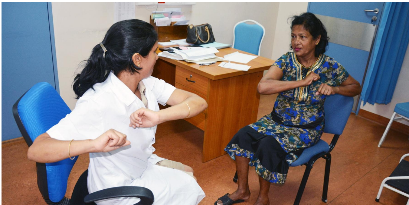
A Diabetic Specialist Nurse in Port Louis, Mauritius, teaches a patient simple limb exercises.